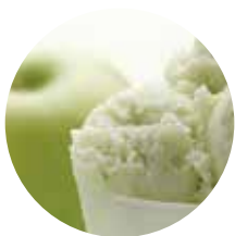
Green apple Granny Smith