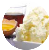
Eggnog with free range eggs