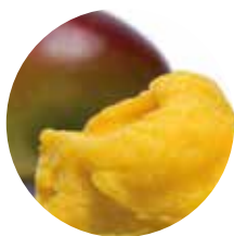
Mango with Indian mango

Most of our fruit flavors are naturally suitable for a vegan diet as they are made without milk and/or animal fats to enhance the quality fruit with which they are made, furthermore, thanks to our "gelato making" technique their texture remain silky and soft. They are also perfect to be served with our vegetarian flavors, rich in milk from our stable.