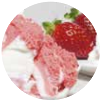
Strawberry & cream