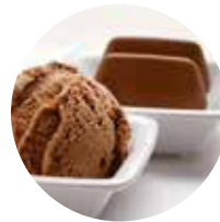
Gianduja exclusively from Piedmont hazelnut IGP