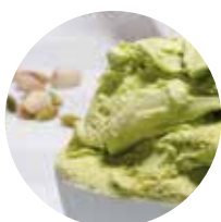
Pistachio 5.0 with the best pistachios of the season