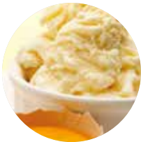
Egg custard made with cage-free chicken eggs