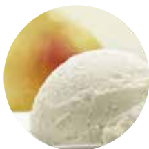
Pear with conference pear