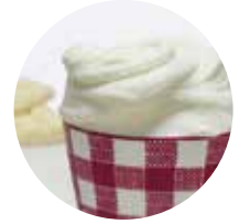
White chocolate with 30% of white chocolate