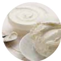
Mascarpone from the Po plain