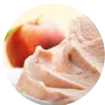
Peach with yellow peach