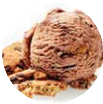
Cookies with cookies in pieces