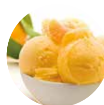
Mandarin with late Ciaculli mandarin