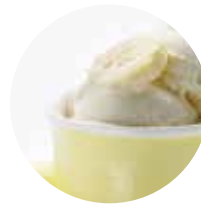
Banana selected ecuadorian banana