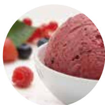
Mixed berries wild blackberries, raspberries & Camarosa strawberries