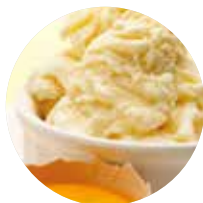
Egg custard made with cage-free chicken eggs