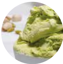
Pistachio 5.0 with the best pistachios of the season