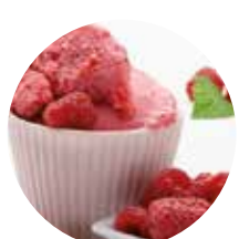
Raspberry with Italian raspberries