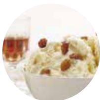
Malaga with sultanas & marsala dop wine