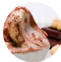
Nocciolata milk chocolate & Piedmont hazelnuts IGP