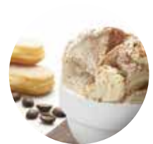
Tiramisù an italian combination of zabaione, coffee & lady fingers