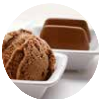
Gianduja exclusively from "piedmont hazelnut IGP"