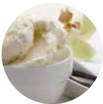
Vanilla from Madagascar with pieces of vanilla pod