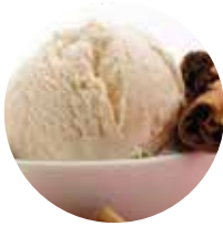
Cinnamon from Indonesia