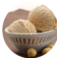
Hazelnut exclusively from Piedmont hazelnut IGP