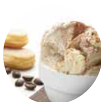
Tiramisù an italian combination of zabaione, coffee & lady fingers