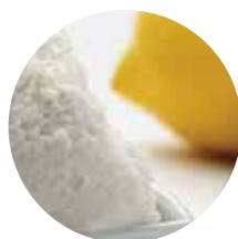
Lemon Sicilian lemon cold pressed juice