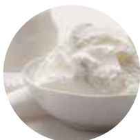
Yogurt natural with live ferments