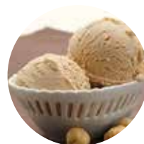
Hazelnut exclusively from Piedmont hazelnut IGP