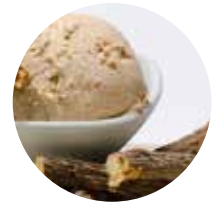
Liquorice with liquorice root