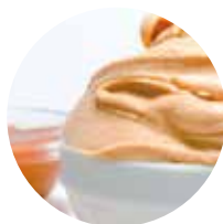
Toffee typical argentine crema mou