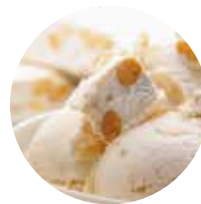
Nougat with IGP Piedmont hazelnuts